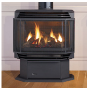
U38E shown with safety screen