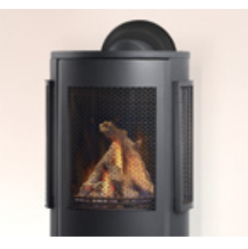
RC500E shown with safety screen